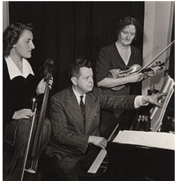
The Canadian Trio: Nelsova, MacMillan and Parlow

not particularly profitable, Parlow looked for other career options. In 1929 she was appointed to the faculty of Mills College in Oakland, California. She received an honorary Master of Arts degree from Mills College in 1933. While at Mills College she began to play in string quartets. In 1936 she accepted a position at the Juilliard School of Music in New York, and remained there until World War II, when she returned to Canada to give a series of lecture-recitals at the Royal Conservatory of Music in Toronto in 1941. There she organized the Canadian Trio , including Zara Nelsova (1917-2002) playing the cello and Sir Ernest MacMillan (1893-1973) playing piano. They received excellent reviews and also made national radio broadcasts.