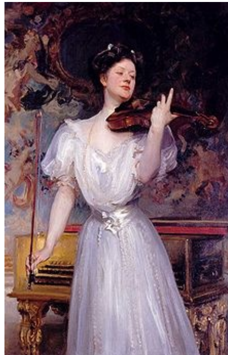
“Lady Speyer” by John Singer Sargent (1907)