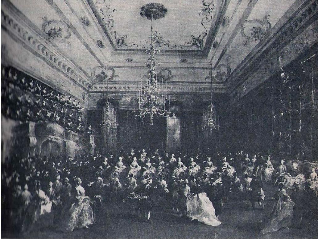
Gala Concert in the Casino Filharmonico, eighteenth century painting by Francesco Guardi

The first famous woman violinist in history was the Venetian musician Anna Maria della Pietà (1695/6 - 10 Aug 1782). In the seventeenth and eighteenth centuries, music conservatories flourished in Venice within the four ospedali for females. Known as I Mendicante, La Pietà, L’Incurabili, and Gli Derelitti, these hospitals, or orphanages, intended to teach destitute